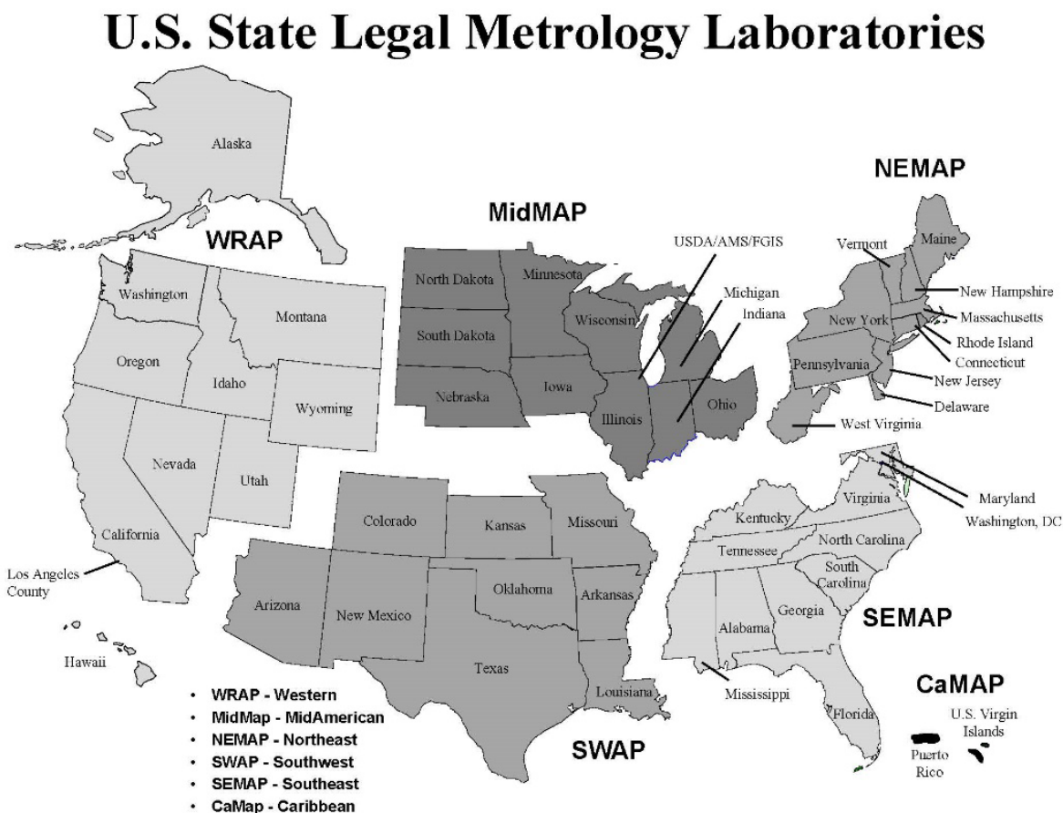
Figure 2. U.S. State Legal Metrology Laboratories Organized into RMAP Groups.

Regional Measurement Assurance Program (RMAP) Requirements. State legal metrology laboratory personnel involved in calibrations covered by recognition shall attend the annual RMAP to participate in the training and PT activities provided by OWM (Figure 2). Annual RMAP participation is required to achieve and maintain ongoing recognition (or concurrent recognition and accreditation). Coordination of national legal metrology issues, distribution of updated procedures, and ongoing professional development are provided. PTs are coordinated through one of the six RMAP regions or through a national plan coordinated by OWM. PT planning and reporting are a key activity of the annual RMAP. Each RMAP maintains a PT Performance Plan to support recognition and accreditation requirements. The State legal metrology laboratory is required to submit the PT Performance Plan with each Recognition Application .